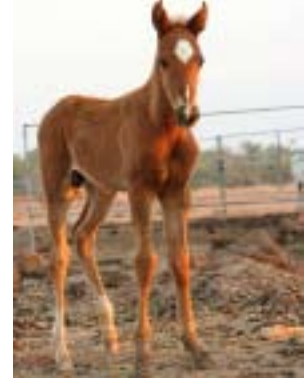
2009 Chestnut Colt by Wingara Slide N Out from Wingara Dash in a Flash. Bred by Murray family of Wingara Quarter Horses, Qld.