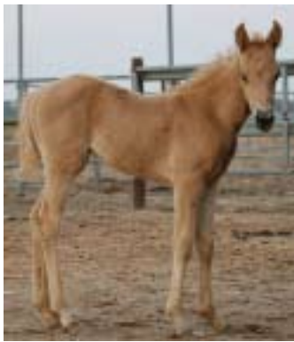
2009 Palomino Filly by Wingara Slide N Out from Wingara Dash in a Flash. Bred by Murray family of Wingara Quarter Horses, Qld.