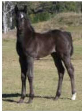
2009 Black Filly by Lil Breeze Bar from Sweet N Special. Bred by Jodie Vanstone, Qld.