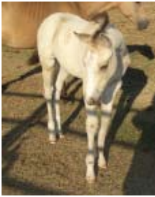
2009 Buckskin Filly bred by Esmay Woods of Rosedale Quarter Horse Stud, Qld. Bloodlines of Go Man Go and There Goes Dusty.